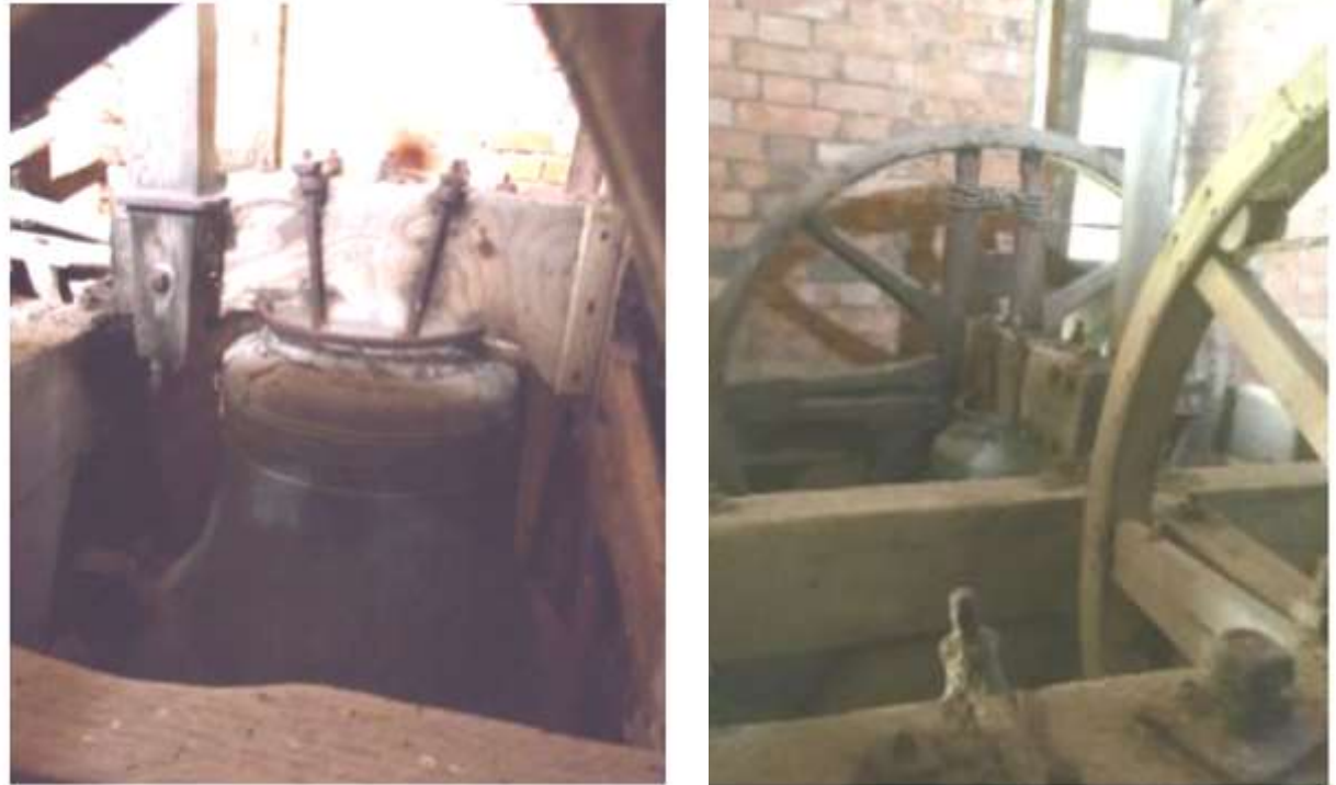
In the belfry at St Andrew's Church